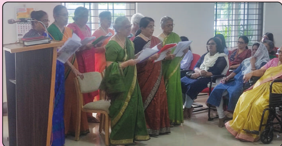
Irene Homes Xmas carols