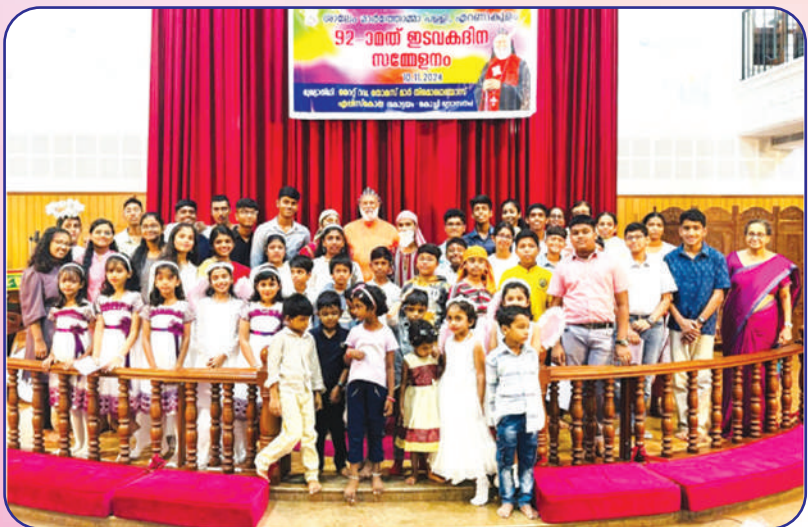
With our Thirumeni on Parish Day