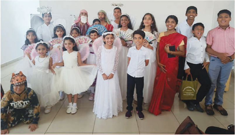
All ready for our World Sunday School Day performance

parents from our church attended the program where our talented children performed a choreographed skit which was much appreciated by all.