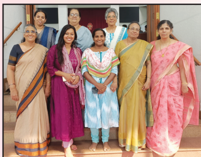
Ernakulam Centre Competition at Christos Mar Thoma Church Kakkanad