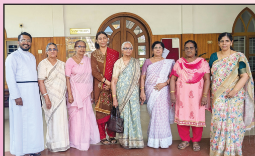
One day medical seminar at St. Thomas Mar Thoma Church, Kalamassery