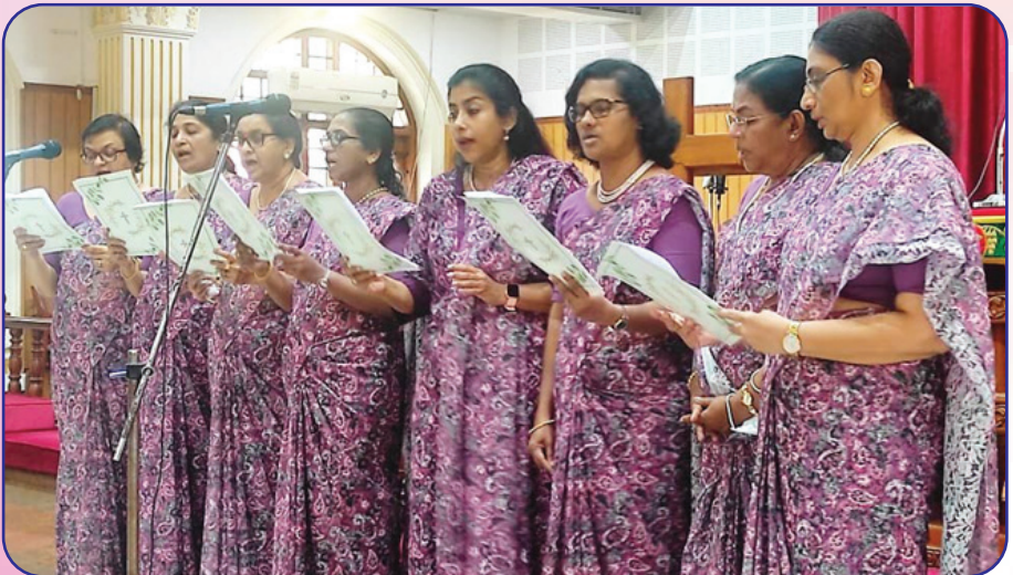
Our teachers present "Deva Karunayilayo" at the Teachers' Retreat