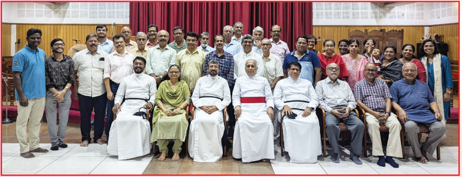
Haisthana Samithy members retreat held at Salem MJC on 28th June 2025