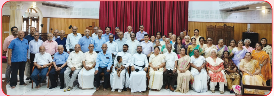
Senior Citizen Fellowship 2024-25 Annual General Meeting