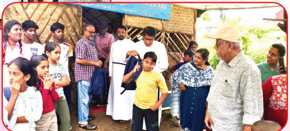
Kanivu distributed School kits to 70 students at Friendship Colony on 31st May 2025