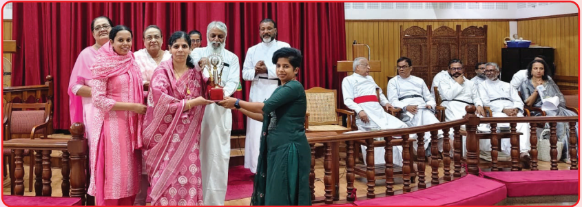
Sevika Sangham Kottayam - Kochi Diocese Competition at Salem MJC