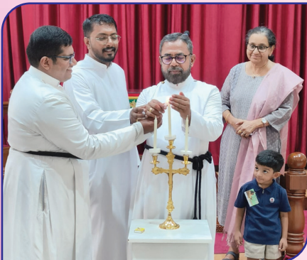
Lighting of the lamp at the Inauguration of VBS 2025