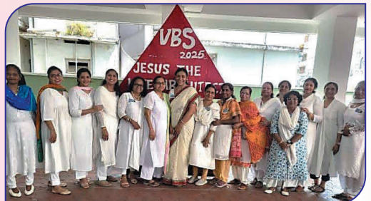
Devoted teachers and enthusiastic volunteers at the VBS