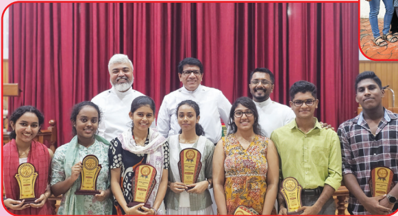
Youth League : Merit Award for the class 10th & 12th