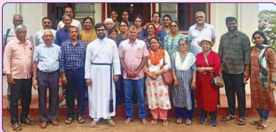
Members of Centre MTVEA visiting Sengottai Mission Field and Church

Request all Parish Members who have completed 18 years to please join our Edavaka Mission Meeting on any Tuesdays at 6 p.m. to listen to the word of GOD.