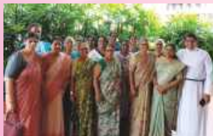
Salem Sevika Sangham members who participated in the First Centre Meeting at the Jerusalem MTC, Elamkulam