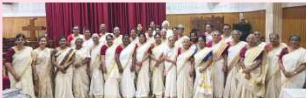
Sevika Sangham Day at Salem MTC, Ernakulam